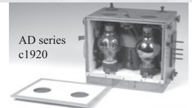
AD series c1920